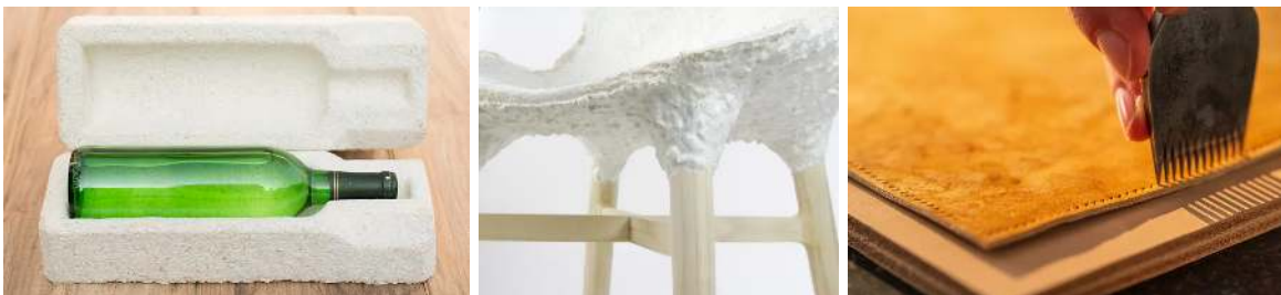
Mycelium Packaging [1] | Mycelium Furniture [2] | Mycelium Leather [3]

It is a grassroots innovation project to locally research, develop and produce a biocomposite material using mycelium as an alternative sustainable material for packaging, construction, apparel and accessories industries. This future-oriented and climate-neutral innovation will bring an added benefit to underserved communities to build their environmental awareness, intellectual capacity and life-changing livelihood opportunities.